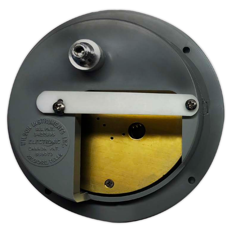
Mounting Bracket / Drive

Wilson Chart drives are designed to meet the high demands of the Oil and Gas market using quartz movement for accuracy and reliability. The "movement-only" feature allows the well tender to simply snap in a new motor when the old one comes to its normal end of life. This method removes the hassle of a field replacement.